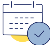
Paid Vacation and Sick Time