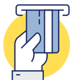
Flexible Spending Account