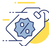
10% Off Lowe's Products

Lowe's also offers access to other additional benefits, including: