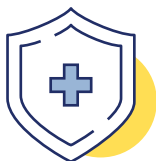
Health, Vision, Dental Insurance

Note: Benefits offerings change each year and eligibility varies. For the most up-to-date breakdown of what's available to you, visit MyLowe'sBenefits.com .