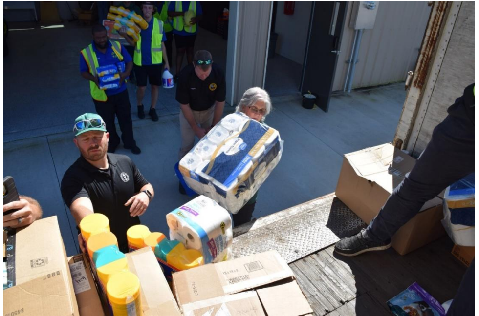
FGC faculty, staff, and students load a semi-trailer with supplies.

Thank you to all participants who gave monetarily, purchased supplies, and devoted time to sorting and packing supplies. I know it was greatly appreciated by those who were affected by this hurricane. Great job Timberwolves!