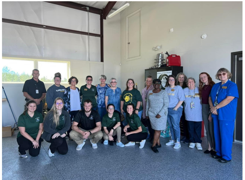
FGC Nursing and Health Sciences faculty, staff, and students gather at the Olustee campus after loading hurricane relief supplies.