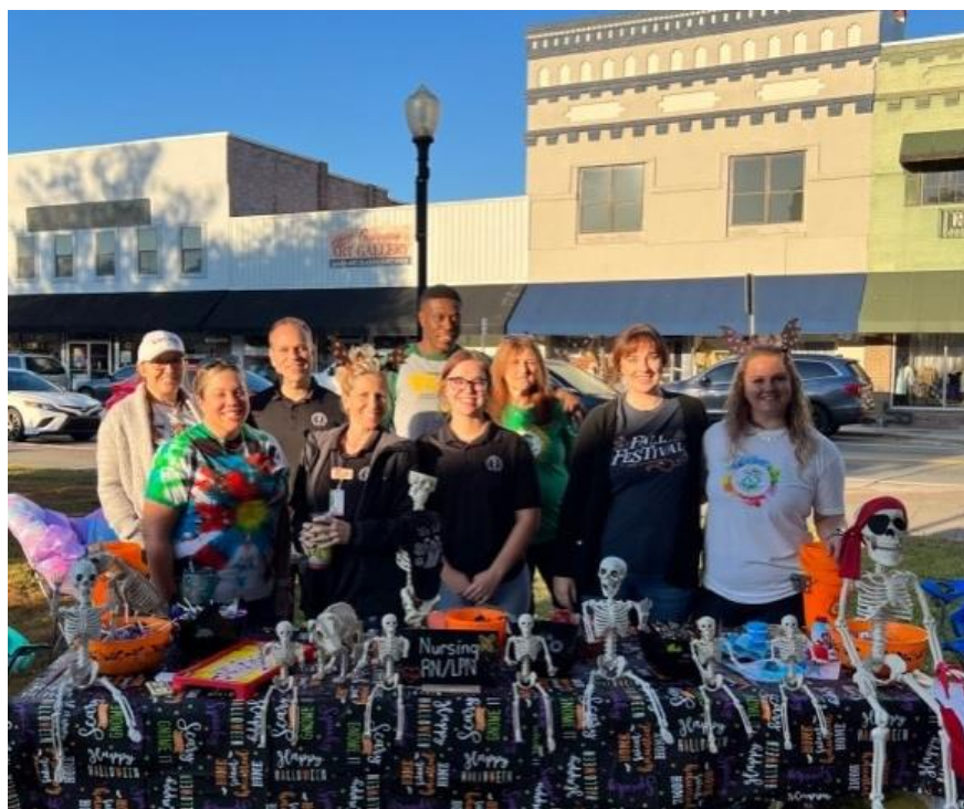
Nursing students and faculty pose at their decorated vendor table.