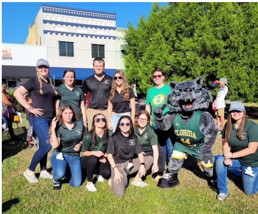
Physical Therapy Assistant students and faculty gather for a photo while serving the community.

Student volunteers assisted with the event and devoted their free time to bring awareness to Florida Gateway College and its current educational programs. Students demonstrated great joy and enthusiasm as they offered a helping hand to the greater Lake City community. One DN&HS faculty member said, "The event was a great time for everyone, and we are looking forward to hosting an event like this annually. It is a wonderful opportunity to give back to our community with the assistance of the FGC administration and its local community leaders."