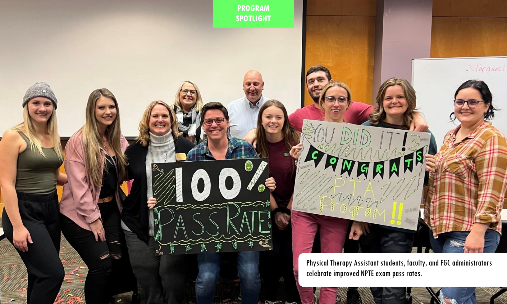
Physical Therapy Assistant students, faculty, and FGC administrators celebrate improved NPTE exam pass rates.