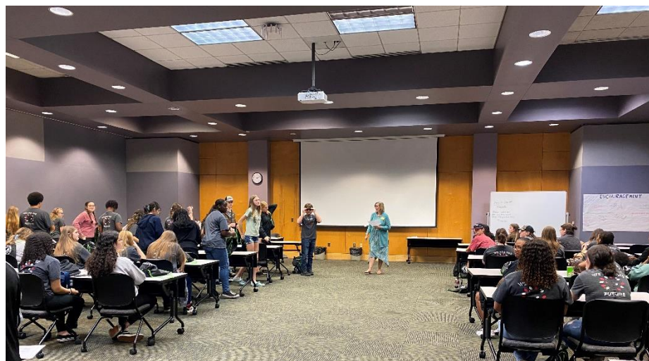
Students engage in an intradermal injection activity.