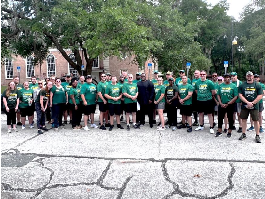
Florida Gateway College administrators along with faculty, staff, and students from the Law Enforcement division and Department of Nursing and Health Sciences gather for a photograph in front of the Columbia County Courthouse.