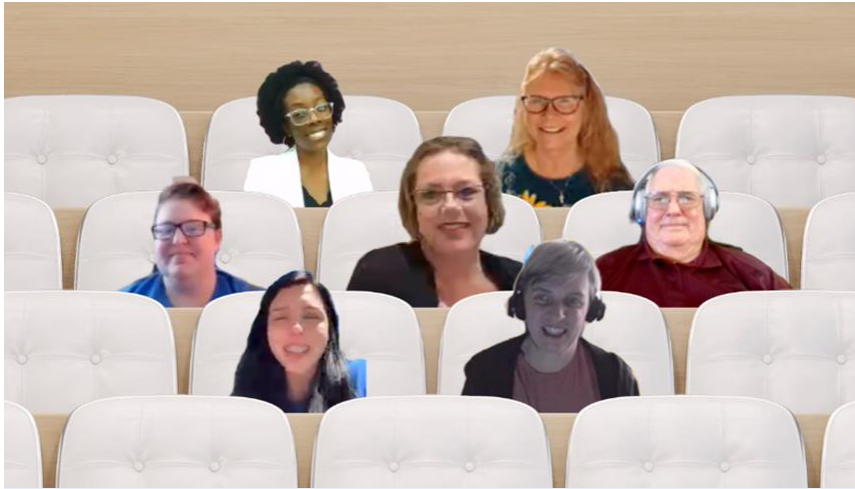
Advanced Medical Coding students and faculty along with two coding staff of Mayo Clinic smile for a photo during their virtual “A Day in the Life...” session.

FGC’s HIT Programs Partner with Mayo Clinic to Provide Virtual Professional Coding Experiences