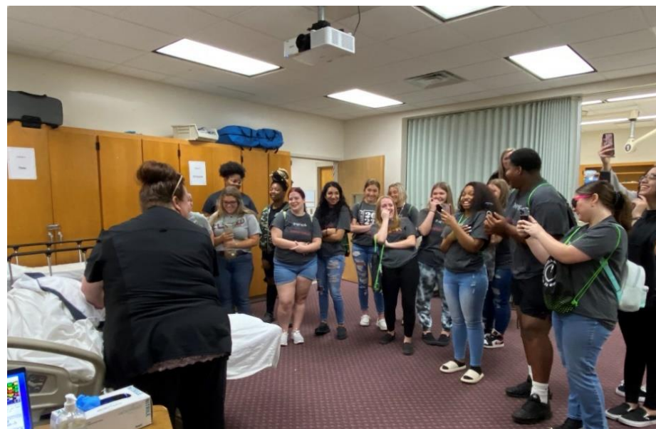
Students witness a labor and delivery simulation.