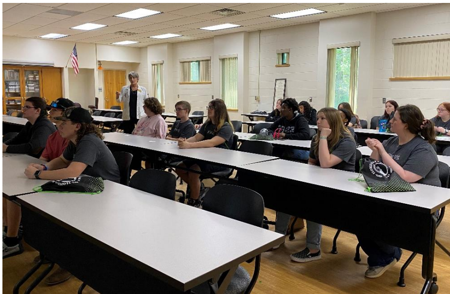
Students observe a presentation about the various health science programs offered at FGC.

At the conclusion of the day's activities, students headed to The Grill for lunch on campus. "The day was truly enjoyable and we're looking forward to seeing them in the future as FGC students," said Espenship. ■