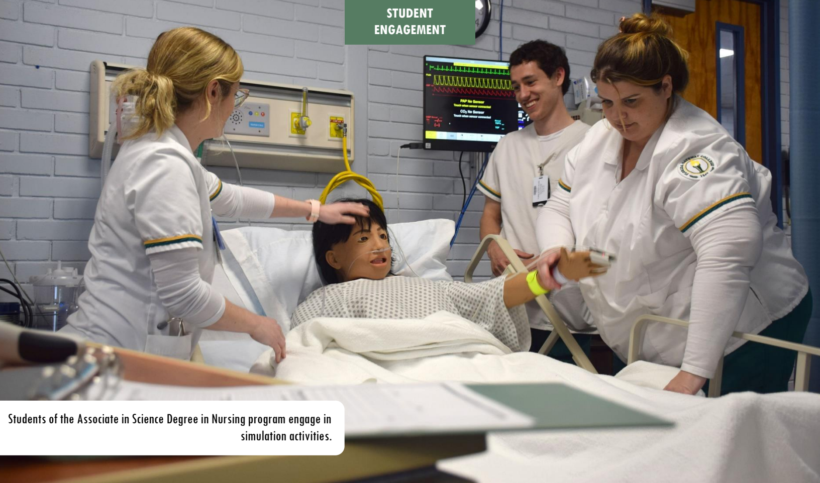
Students of the Associate in Science Degree in Nursing program engage in simulation activities.